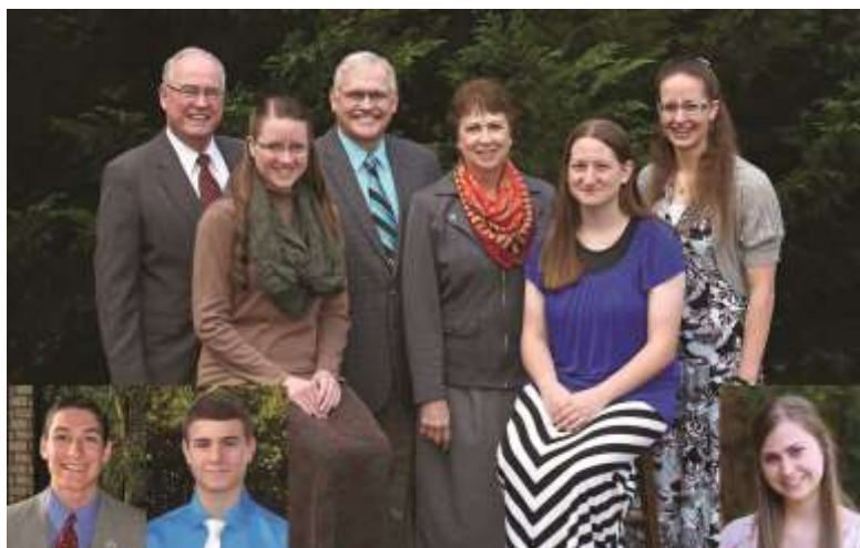
The MTT Brazil Mission Team – May 11 – June 8, 2016

Email Address: mttministries@aol.com Phone Number: 864-982-3398