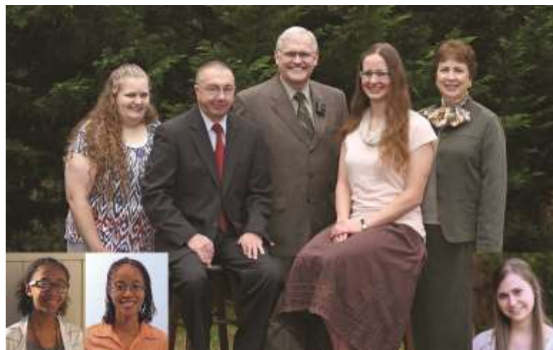
The MTT Canada Mission Team – July 22 – August 22, 2016