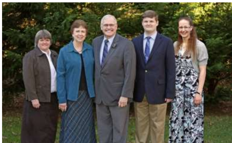
The MTT U.S. West Mission Team – June 16 – July 18, 2016